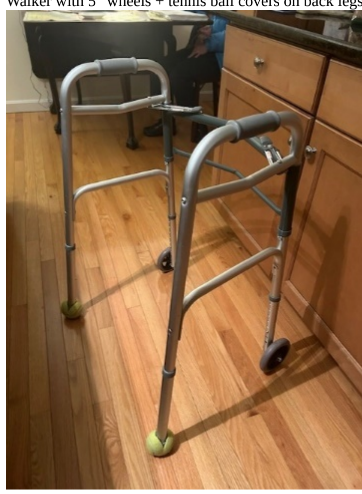
Walker with 5" wheels + tennis ball covers on back legs