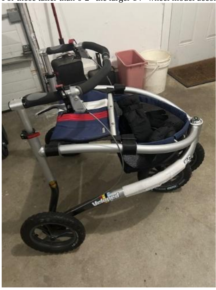
VELOPED handle adjustment is simple and secure with snaps on each side to loosen and tighten.

Trionic VELOPED Sport-12" wheel model with 4 inflatable tires is recommended for folks with body height 4'11" to 6'2". For those taller than 6'2" the larger 14" wheel model accommodates and is recommended.